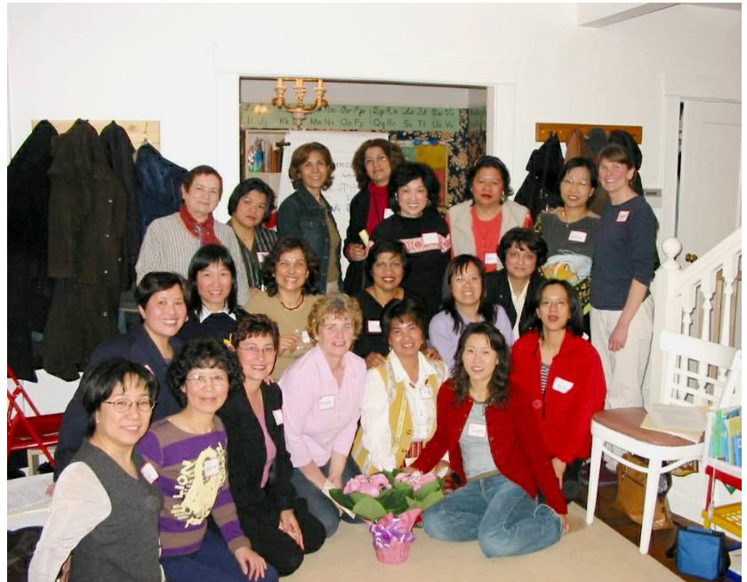
Members in our first AGM

Vancouver Family Child Care Association Empowering members to provide quality child care vancouverfcca@yahoo.ca