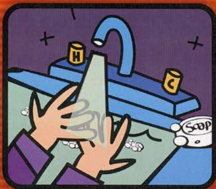
Rinse your hands