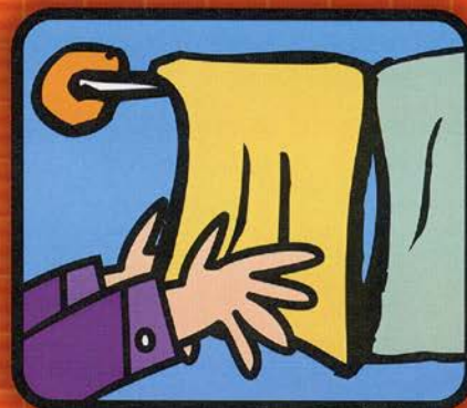
Dry your hands