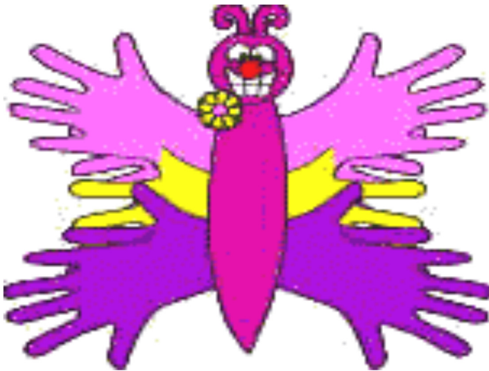
Hand Print Butterfly

Cut assorted heart shapes in different colours. Glue in a butterfly shape or caterpillar design